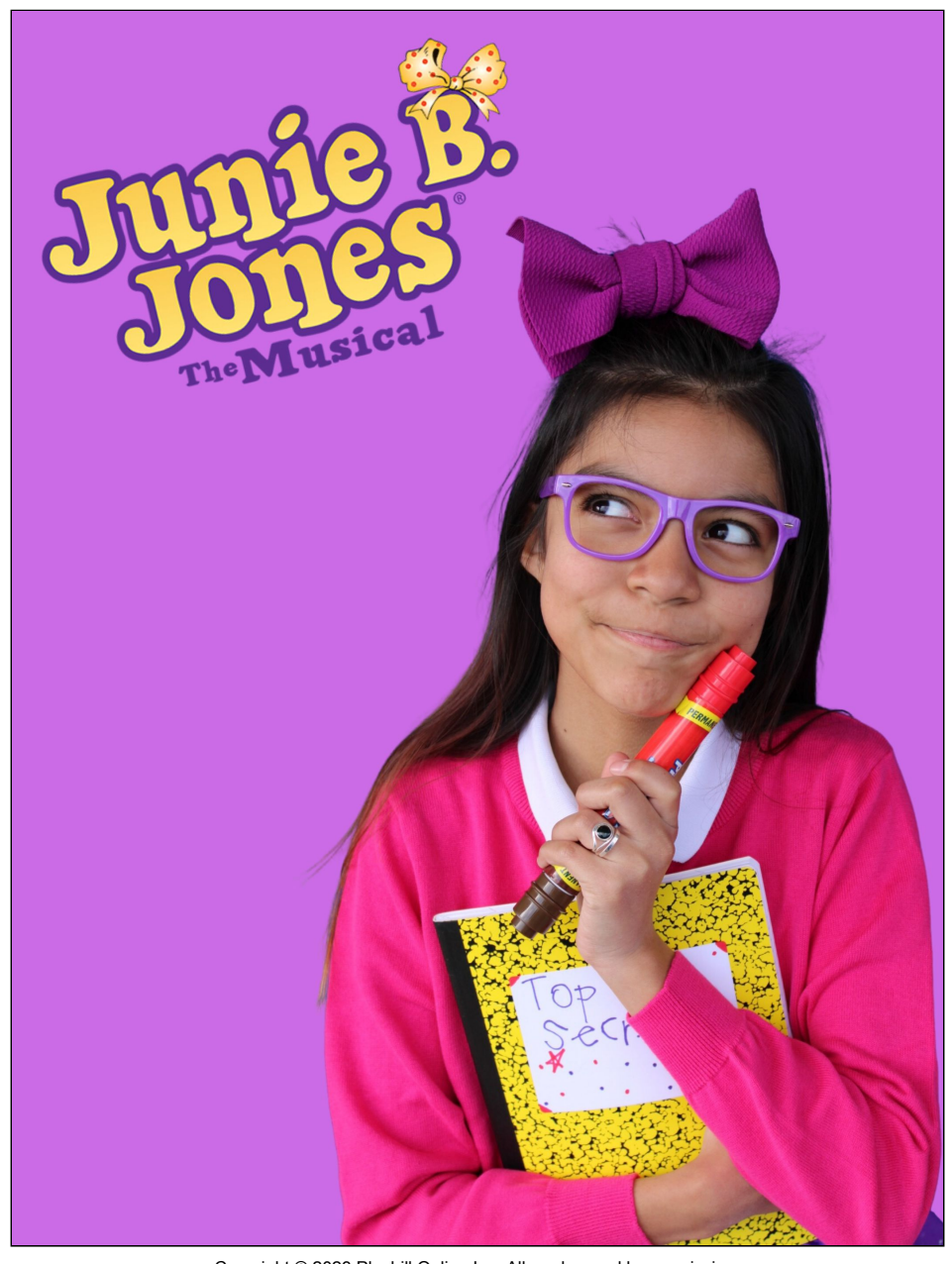
Copyright © 2023 Playbill Online Inc. All marks used by permission.

Young Actors' Theatre Spring Valley, CA May 11-21, 2023